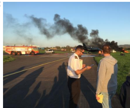
Oh dear...what have CO and our new Chairman been up to?! More on this in the next issue

Divisions are held the last Wednesday of each month which is when No1 uniform is worn and inspected, promotions and badges are issued. Cadets and juniors are asked to please make sure their uniform is ready for inspection.