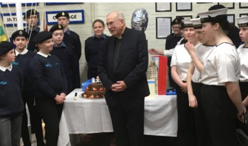
Below right: the Juniors having their photo-call with Padre