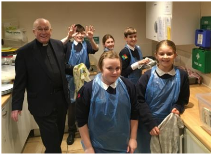
The bad side of cooking...washing up!

January saw the Juniors looking at the Sea Cadet promise, galley dangers and hygiene and making a set of junior class room ground rules as well as a treasure trail around the unit finding various rooms and staff.