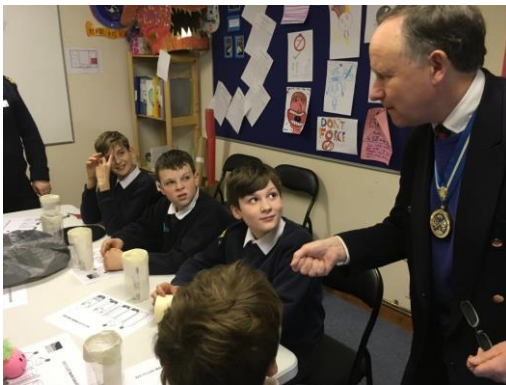
The High Sheriff demonstrates the potential use of the ceremonial sword to a mixed response!

At evening colours, the High Sheriff gave out the following awards to cadets: 1st place for the Junior Rowing Team in the South West Area Competition, 3rd place for the Junior Rowing Team in the National Competition and 3rd place for the Unit Power Boating Team in the South West Area Competition. We are fortunate as a unit to have the support and interest of those who serve the county in high office.