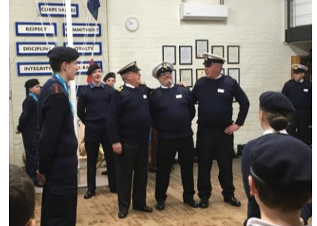
A trio of Birthday Boys being serenaded by the Unit Corps