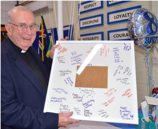
Padre shows off his signed picture frame