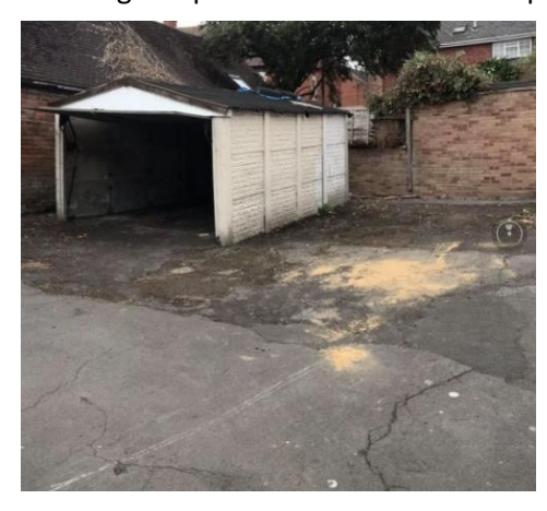
Here's the garage, emptied and ready for demolition!

After an awful lot of fund raising we are thrilled that our Outdoor Space project is now well and truly underway. The project started with a clean up session in September and the following week, work began on demolishing and removing the old garage, taking up of the old flooring and laying of the new tarmac. An outside platform for 'Colours' ceremonies has been put in place as well as an area to keep the bins tucked away. Next stage will be to install the new bike shed and start construction of the new marine engineering building, which is due to start in January 2019. Our very grateful thanks go to David Southwood, Chair of Trinity House South West Charities Committee for their generous £3,000 donation that has allowed us to get started on this last phase of the project. We have lots of plans as to how to use our new facility and the wonderfully flat and even surface will, of course, make a great place to start all that drill practice in 2019!