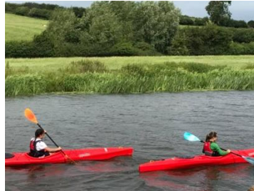
Kayaking on a very windy Saturday