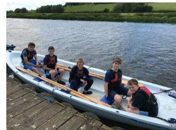
The Junior Boys Rowing Team catch their breath following their final race