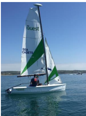
The RS Quest gets put into action on the sea