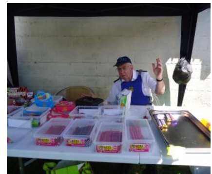
Padre looking after the Stand Easy Stall