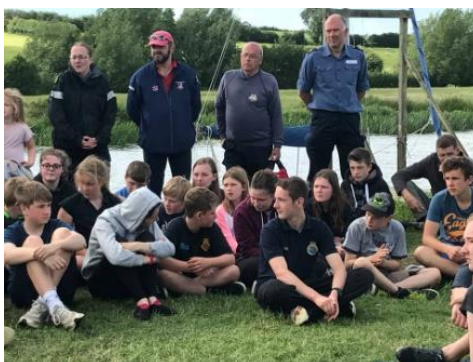
Tired cadets resting before the presentations