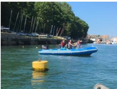
...whilst others have a go in the 'RIB'. Looks like Padre has disembarked!