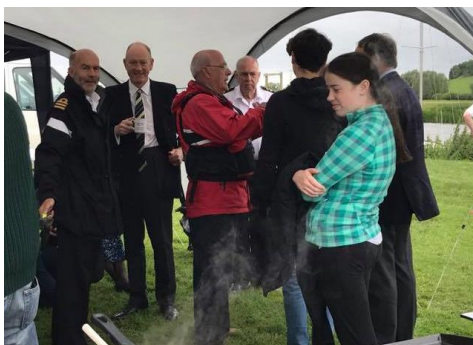
Our VIP guests on Saturday