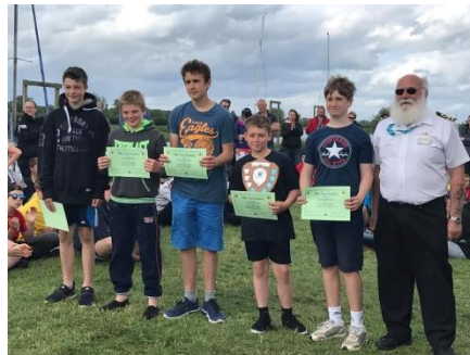
The Junior Boys Rowing Team proudly hold their certificates for their first place