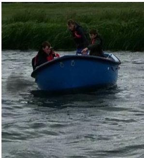
Power boat handling on a choppy Avon!