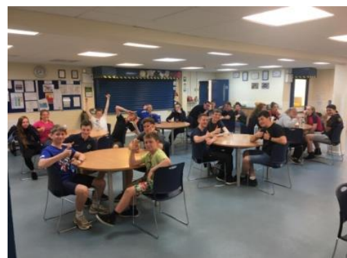
And back at the Training Centre