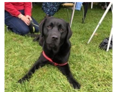
'Commander Juno' being very well behaved