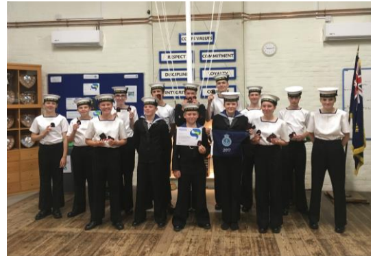
Recipients of skill badges and promotions with the Unit Burgee and the Area Junior Boys Rowing Certificate