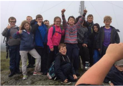
A misty morning on Dartmoor, but the Juniors are ready for action