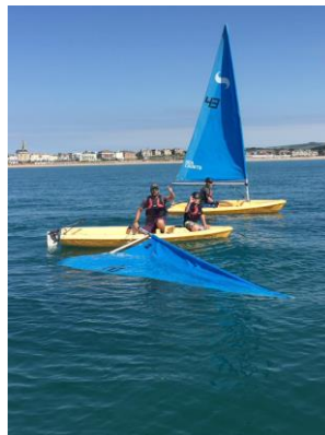
Everything is under control...!