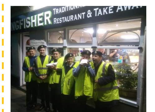
We <u>REALLY</u> enjoyed the chip shop survey!