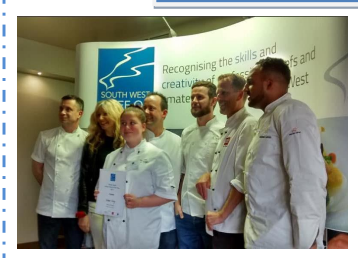
Amber surrounded by the South West Chef of 2017 judges.