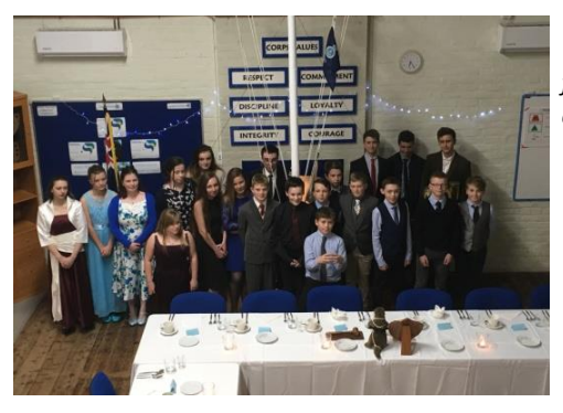
The cadets gather for their special evening

It was a fantastic evening and great fun. Thank you to all the staff who gave up their Saturday night to make this so special.