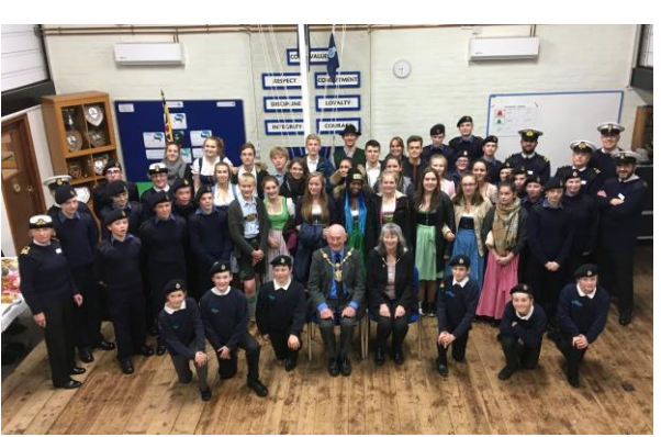
The Mayor and his wife amongst the assembled throng