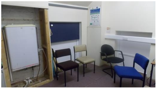
'IT Room' before...