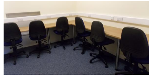
...and after! Laptops and printer still to be installed