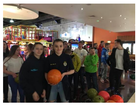
Ready to knock down some pins

Enormous thanks must go to CO for organising such a great evening out.