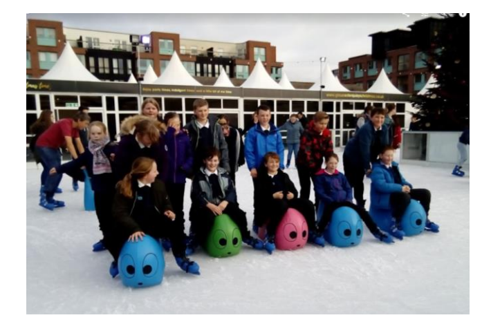
Fun on the ice and fun at the museum!