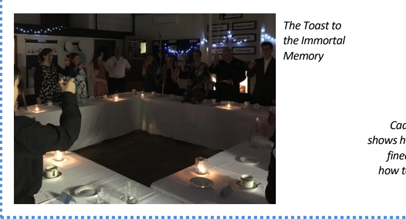
The Toast to the Immortal Memory